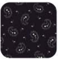
CX3348 Black Indigo Paisley 1/2 yd