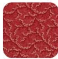
CX3347 Red Indigo Branch 1/4 yd