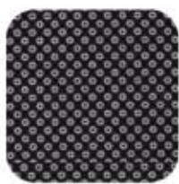
CX3318 Ebony Mae 1/2 yd