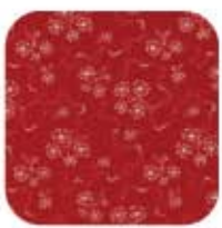
CX3345 Red Indigo Ribbons 1/4 yd