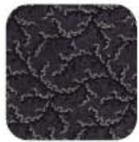
CX3347 Black Indigo Branch * 2-1/2 yd