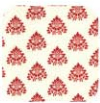
CX3323 Cherry Mary 3/8 yd