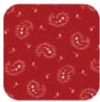
CX3348 Red Indigo Paisley 1/4 yd