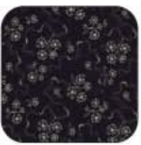
CX3345 Black Indigo Ribbons 1/2 yd