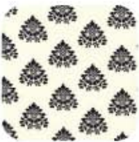
CX3323 Ivory Mary 3/8 yd

* Includes 2 yards for binding and backing.