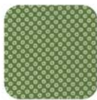
CX3318 Sage Sage 5" x 18"