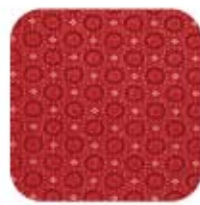
CX3346 Red Indigo Medallion 1/4 yd