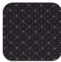
CX3346 Black Indigo Medallions 1/2 yd