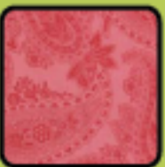
CX3197 Peggy Paisley Candy 3/8 yard