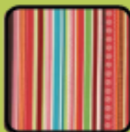
CX3196 Pretty Stripe Watermelon 3/8 yard