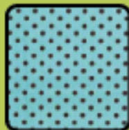
CX2490 Dumb Dot Aqua 1/4 yard