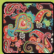
CX3199 Patti Paisley Watermelon 7/8 yard