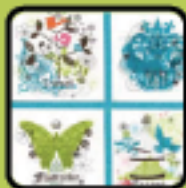
CX2898 Escape Watermelon 3/8 yard