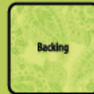
CX3197 Peggy Paisley Lime 56" x 56"