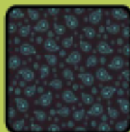
CX3195 Polly Paisley Spa 1/2 yard