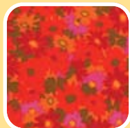
CX3187 Tangerine Hoodies Garden 5/8 yard