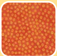
CX0274 Orange Giddy Dot 3/8 yard