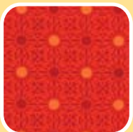
CX3182 Organge Beatnik Daisy 3/4 yard