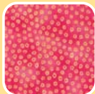
CX0274 Pink Giddy Dot 3/8 yard