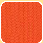
CX3184 Orange Beatnik Blur 3/8 yard