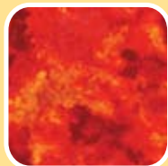
CX3060 Lava Waterspot 5/8 yard