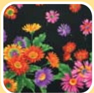
CX3388 Black Claire 2/3 yard