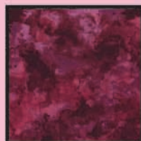
CX3060 Berry Water Spot Fat Quarter