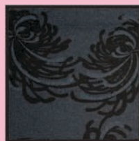
CX3649 Black Texture Mums 7/8 yard