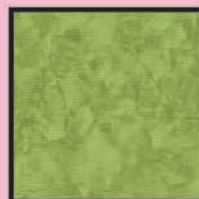
K1053 Krystal Fat Quarter