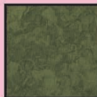
K1156 Krystal Fat Eighth