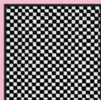
CX0482 White Clown Check Fat 1/8