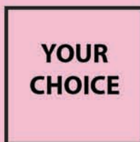
Backi ng Your Choice 55" x 55"