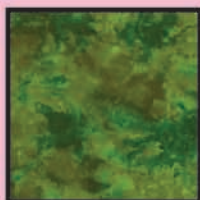
CX3060 Moss Water Spot 1/2 yard