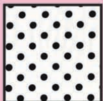
CX2489 White That's it Dot 1/3 yard