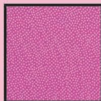
CX1065 Orchid Garden Pindot 1/3 yard