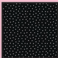
CX1181 Onyx La de Dot 3/4 yard