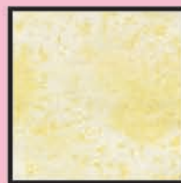
CM376 Butter Fairy Frost Fat Eighth