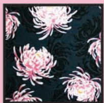
CX3648 Black Midnight Mums 3/4 yard