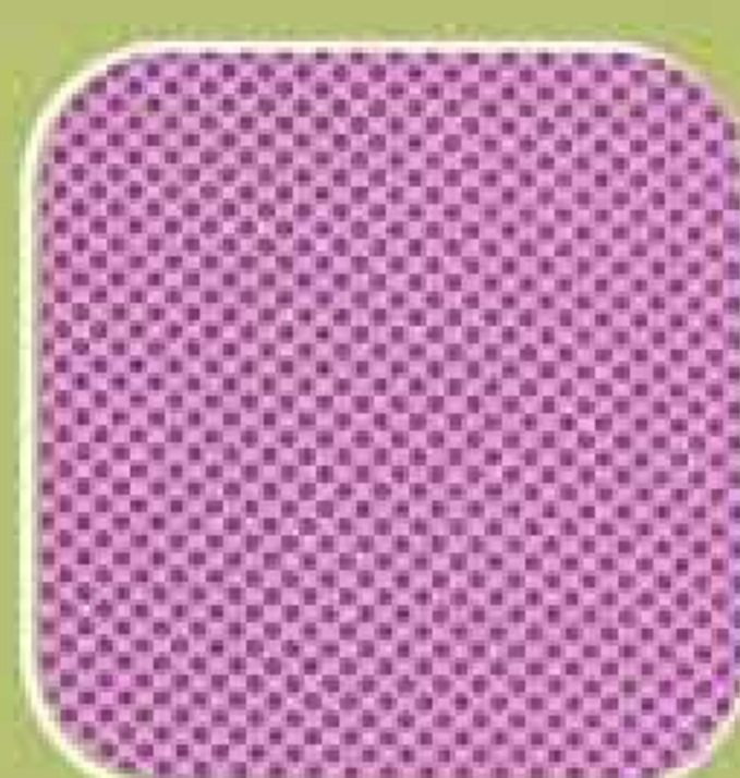
CX3318 Orchid Backing 55" x 55"