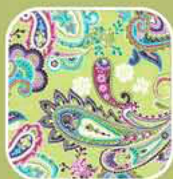
CX3199 Kiwi 7/8 yard