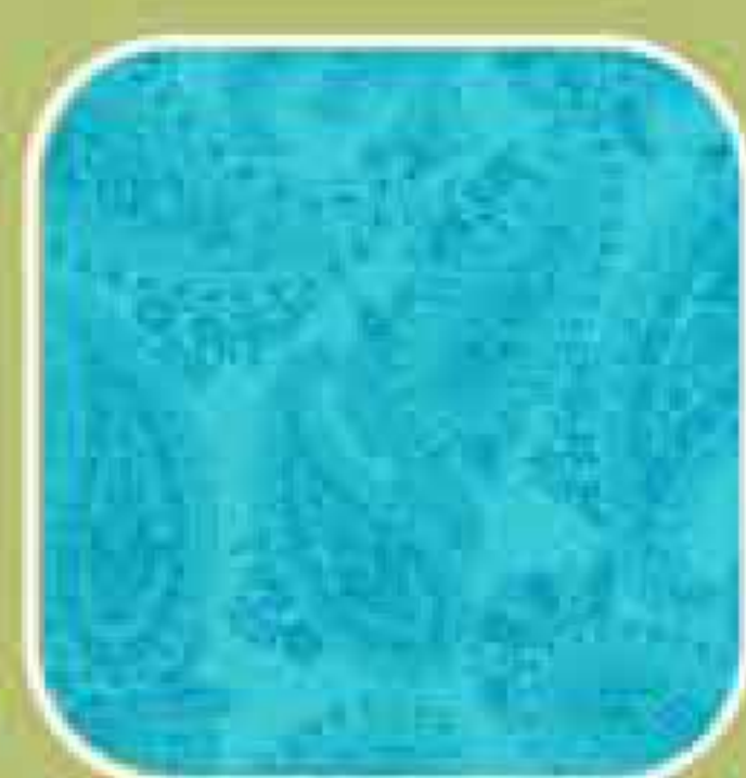
CX3197 Turquoise 1/3 yard