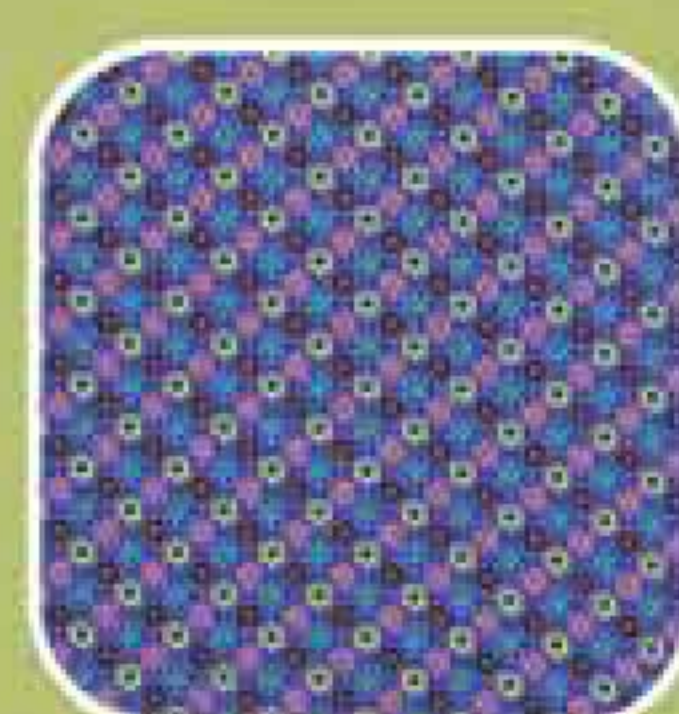
CX3319 Violet 1/3 yard