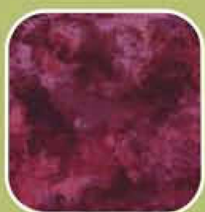
CX3060 Berry 1/4 yard