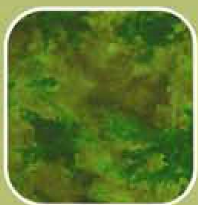
CX3060 Moss Fat 1/8