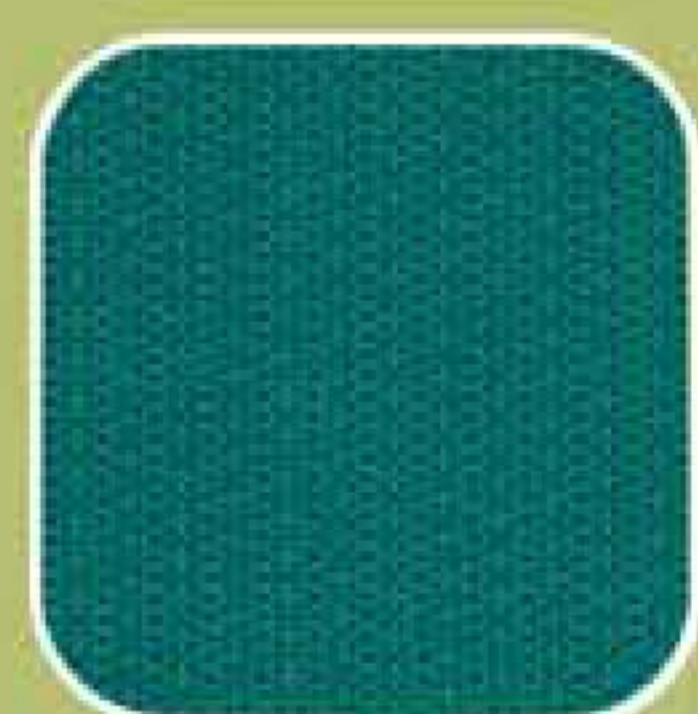
CX3184 Teal 1/3 yard