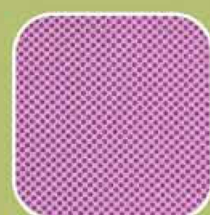
CX3318 Orchid 1/4 yard