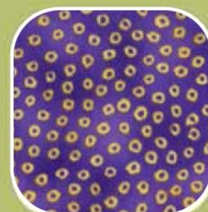
CX0274 Purple 1/2 yard