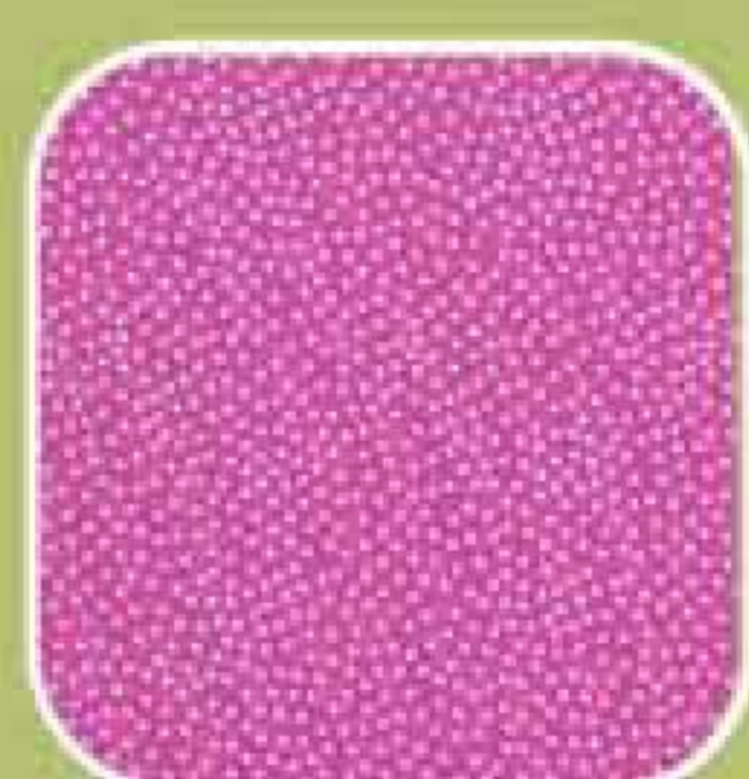
CX1065 Orchid 1/4 yard