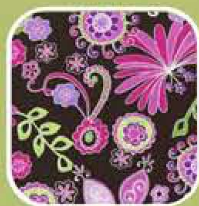
CX2733 Orchid 1-1/8 yard