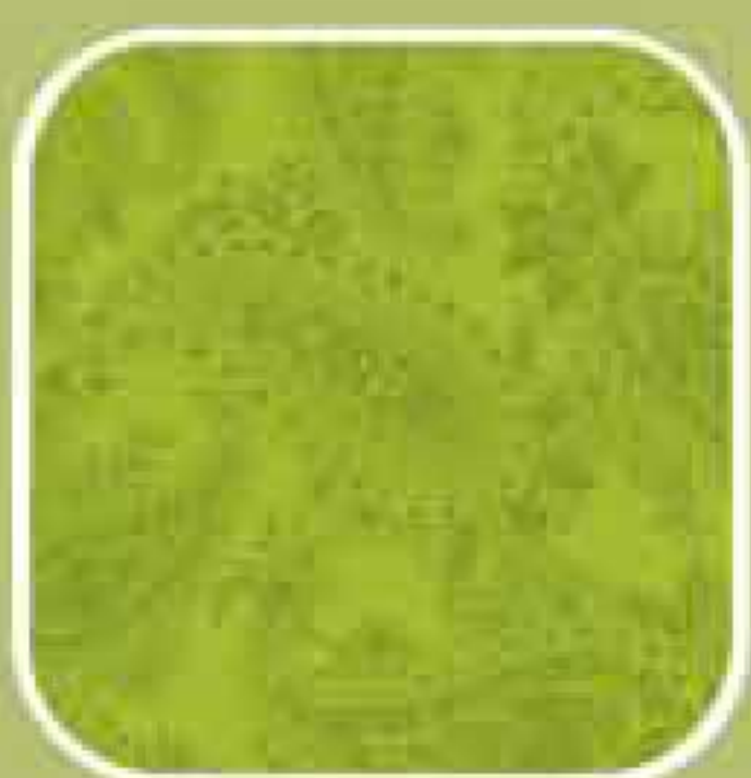
CX3197 Grass Fat 1/8