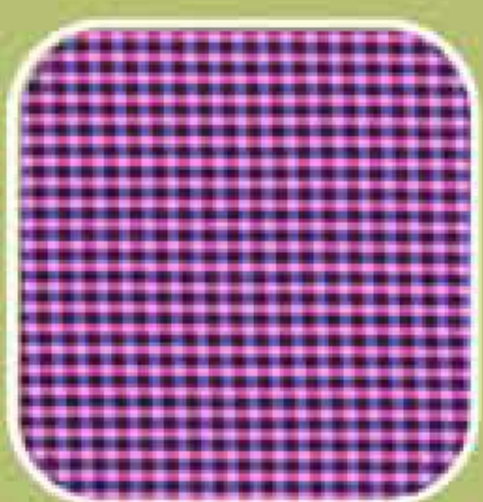
CX3248 Violet 1/4 yard