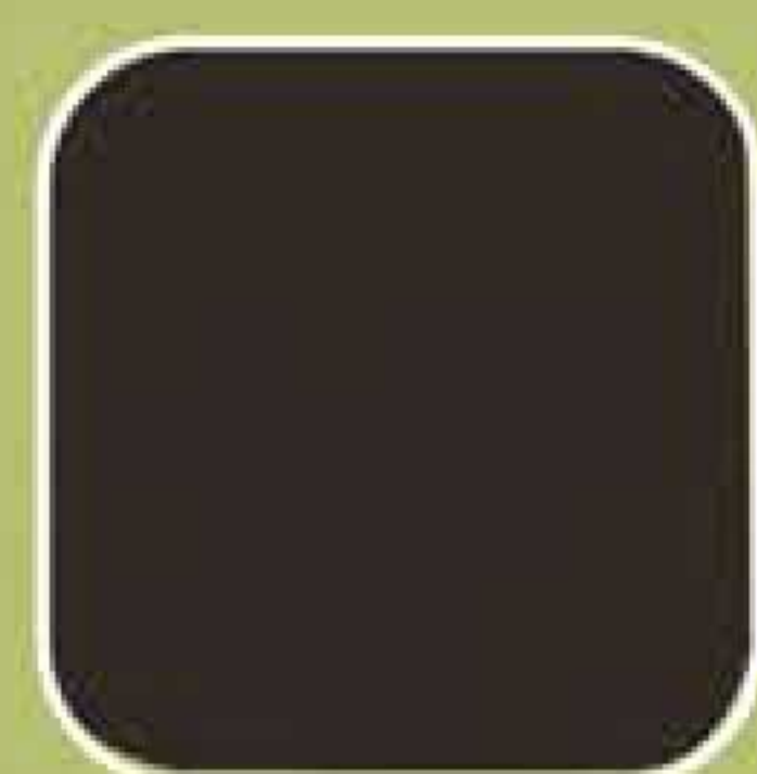
Jet Brown 1/2 yard