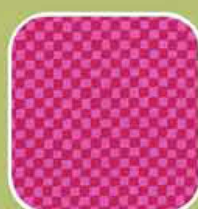
CX0482 Orchid 1/4 yard