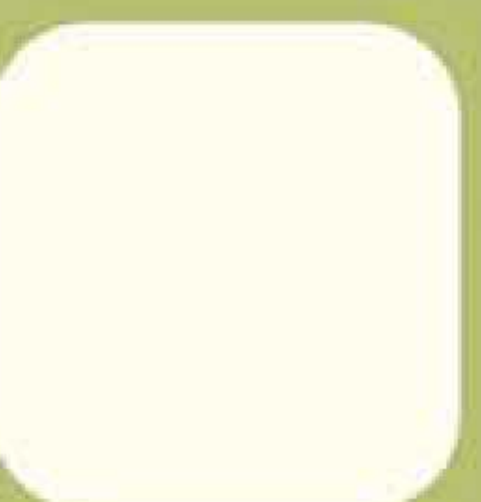
Batting 55" x 55"