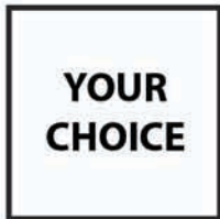
Backing Your Choice 55" x 55"