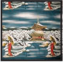
CM3675 Winter Temple One Motif