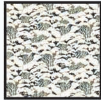
CM3676 Winter Winter Forest 1/4 yard