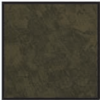
K2255 Krystal Fat 1/4