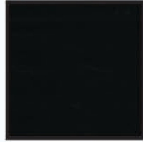
Jet Black 3/8 yard