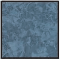
K1167 Krystal 1-7/8 yards