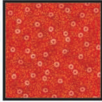
CX3307 Red Kimono Floral 3/8 yard