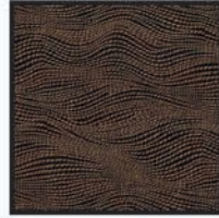
CM3677 Bark Kyoto Blocks 1/4 yard