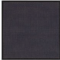
CX3308 Black Imperial Texture Fat 1/4