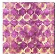
DC3723 TILE MOSAIC- WINE approx. 1/2 yard