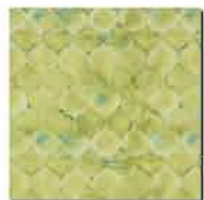
DC3723 TILE MOSAIC- CITRON 1/2 yard