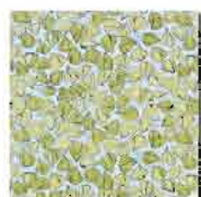
DC3727 SCATTERED LANTERN PODS- CITRON 1 3/4 yards