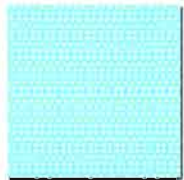
DC3725 POLKA DOT- AQUA 1/4 yard