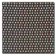
DC3725 PAINTED POLKADOT- BROWN 1/4 yard