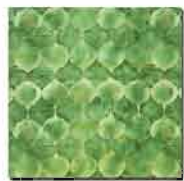
DC3723 TILE MOSAIC- GREEN 1/2 yard