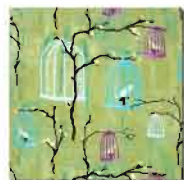
DC3726 HANGING CAGES- LIME 1 1/2 yards