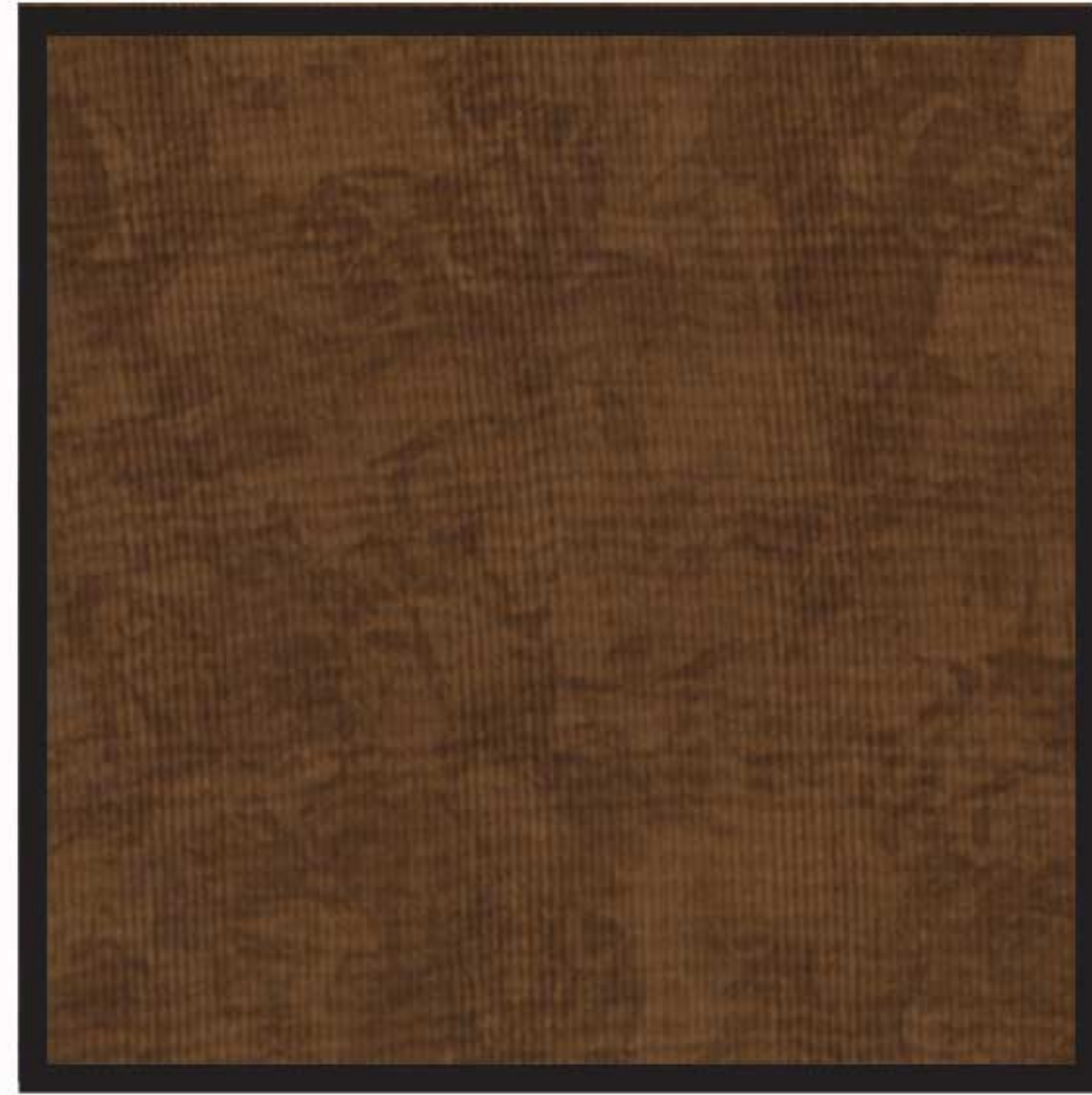
K2122 Brown Krystal 1 yard