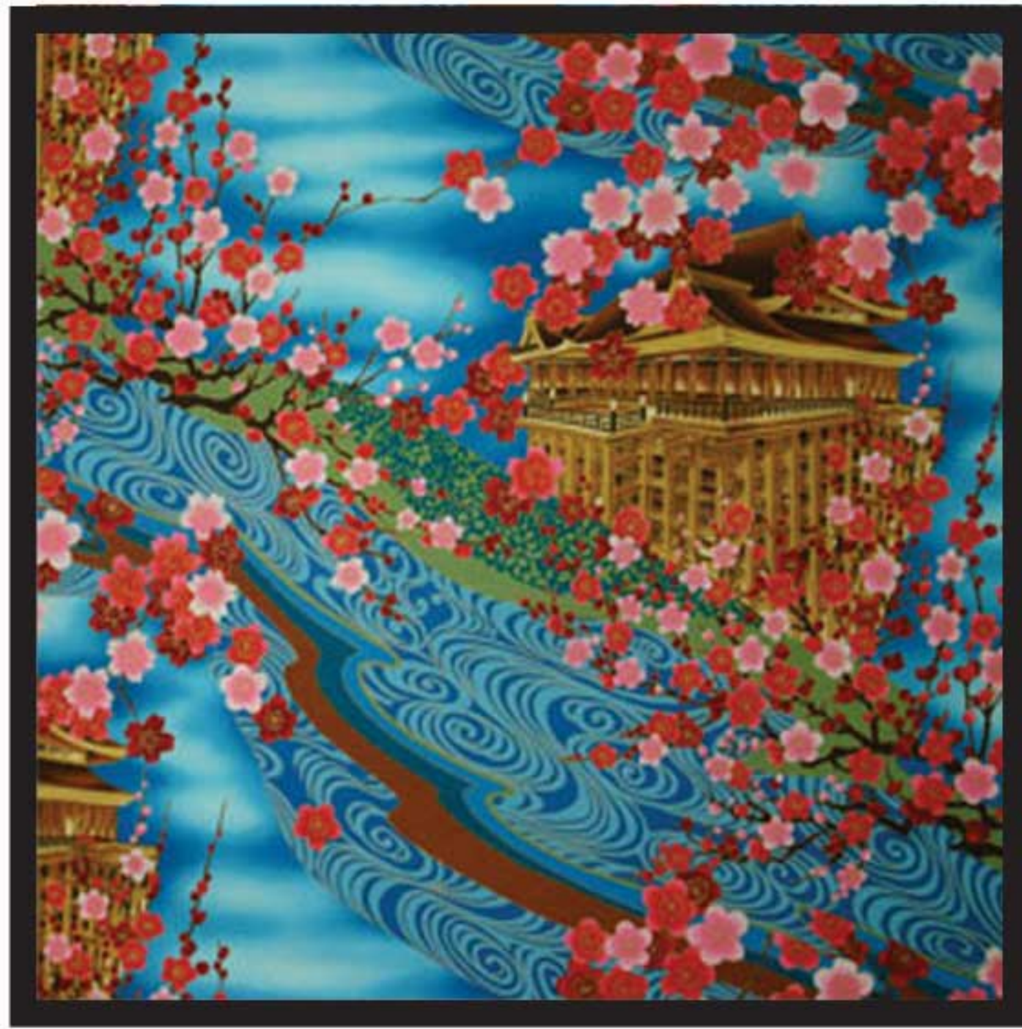
CM3672 Blue Spring Temple 1-1/4 yards