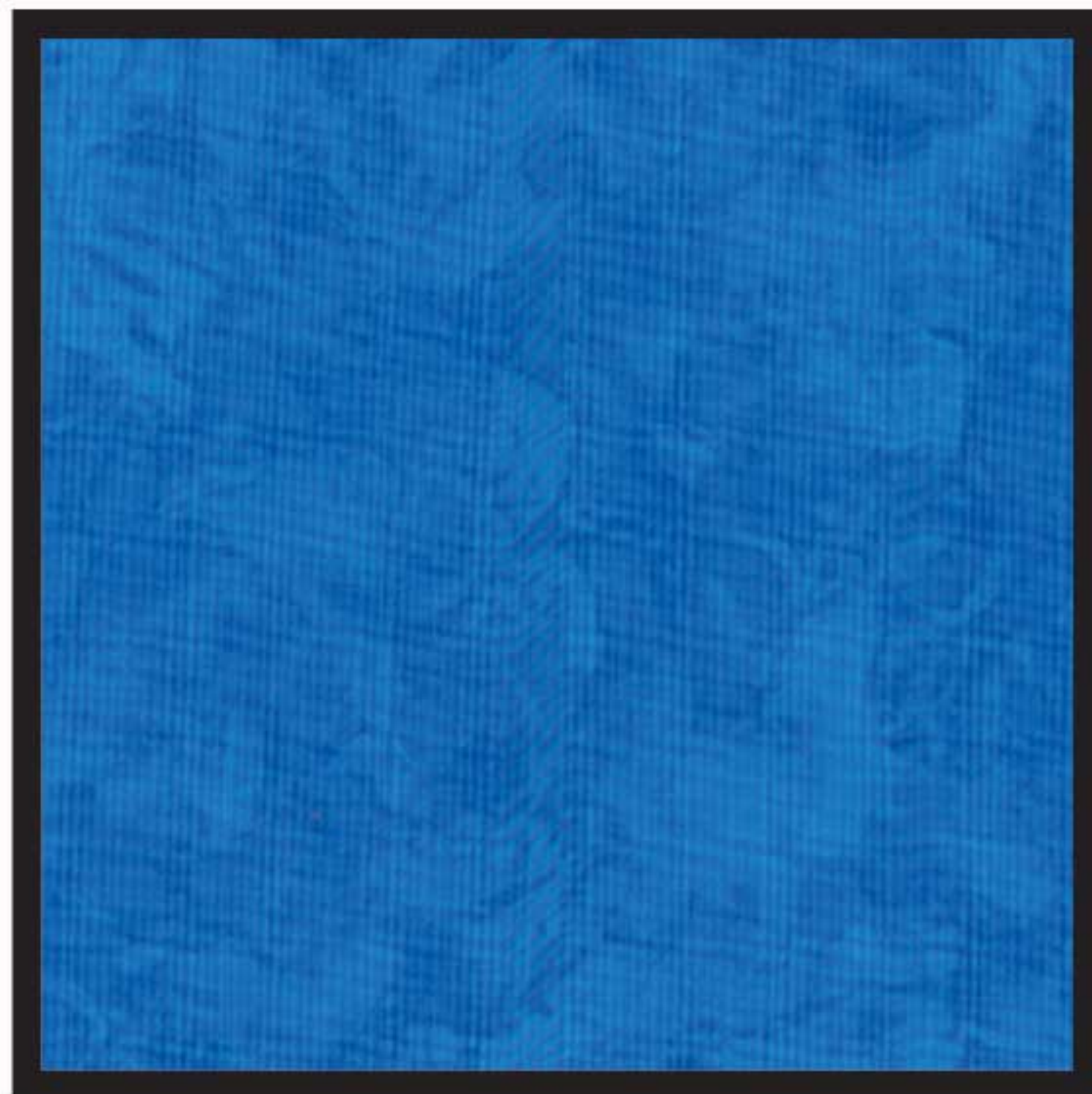
K1168 Dark Turquoise Krystal 3/8 yard