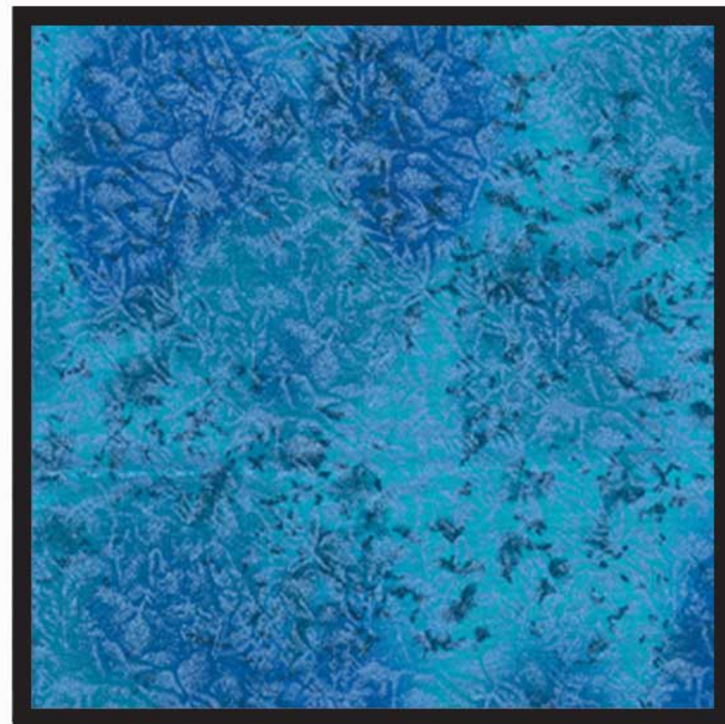
CM0376 Turquoise Fairy Frost 1/4 yard