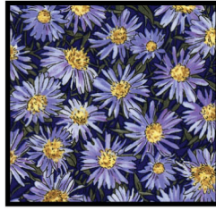
DC3931 Peri Dainty Daisies Fat Quarter