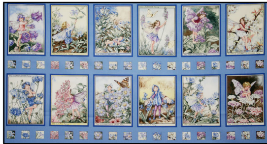
*DC3883 Peri Periwinkle Fairies Panel 2/3 yard