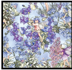
DM3881 Peri Periwinkle Fairies Fat Quarter